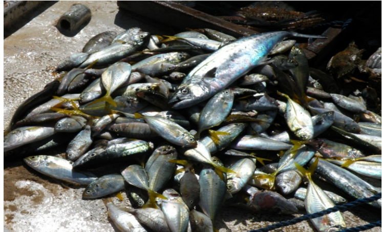
Gaza's fishing zone has been reduced to 3 nautical miles

Water resources in the Gaza Strip are critically insufficient, and with agriculture representing over 60 % of water demand [30], immediate improvements in both quantity and quality are vital. Farmers are forced to use salty and polluted water from agricultural wells for irrigation, which presents a risk to the population's health due to the resulting food quality degradation. As demand for agricultural water has risen, farmers have been forced to dig over 2 000 unlicensed wells [31], which are putting excessive pressure on the coastal aquifer and increasing the salinisation of ground water, and subsequently restricting agricultural productivity. Extensive construction of water infrastructure is needed for both agricultural and domestic use. Currently only 57% of water pumped into the network is utilised [32], mainly due to leakages that demand major rehabilitation of the water network.