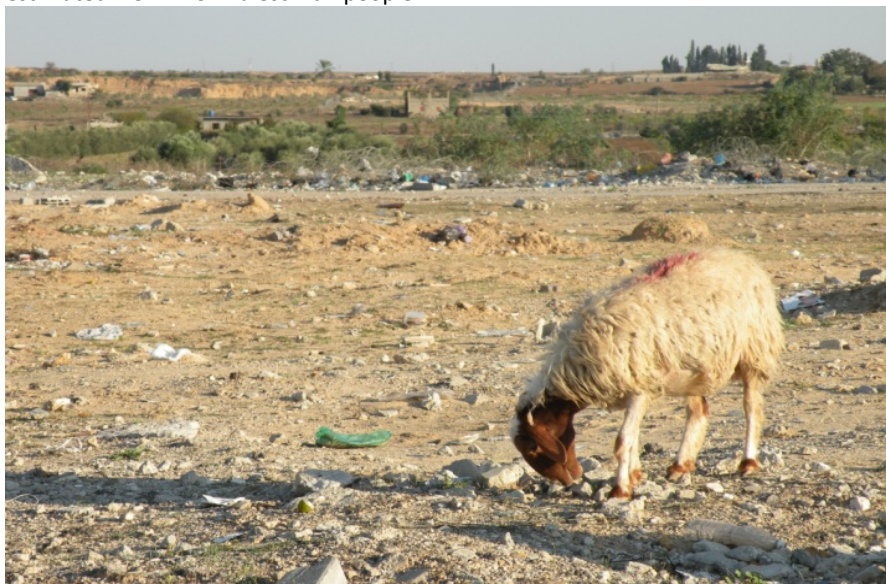
After June 2009, 46 % of agricultural lands were assessed to be inaccessible or out of production in Gaza

Livelihoods and lives of people living in the Gaza Strip have been devastated by over 1 000 days of near complete blockade. However, with the investment of simple inputs and increased access to land, the Agriculture Sector has the potential to make substantial improvements to the quality of life, food security and nutrition of an estimated 1.5 million Palestinian people.